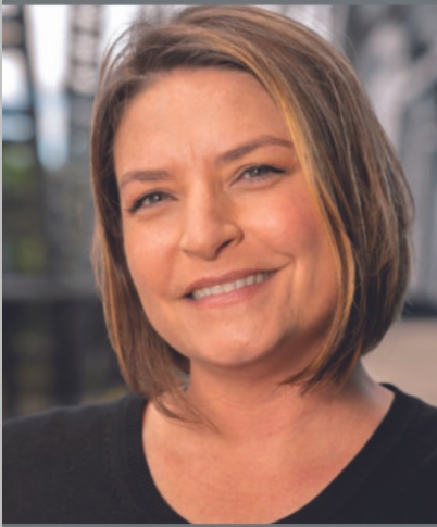
Yamhill County Business Retention & Expansion Manager SEDCOR