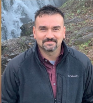
City Manager, City of Falls City