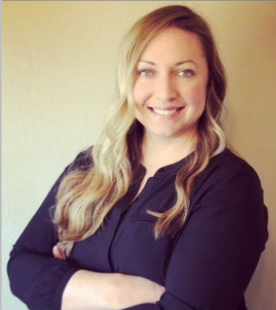
Economic Development Director, Grant County