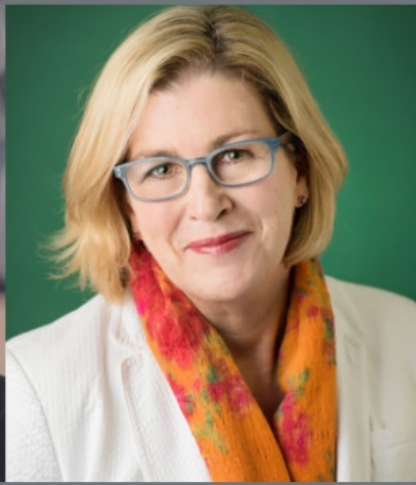
Executive Director GEODC