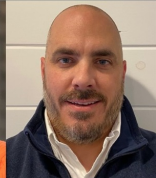
Project Manager, City of Salem

OEDA's Professional Development Committee is calling on YOU our dedicated OEDA Members and Partners, to help develop and grow the OCED Training Program for future generations.