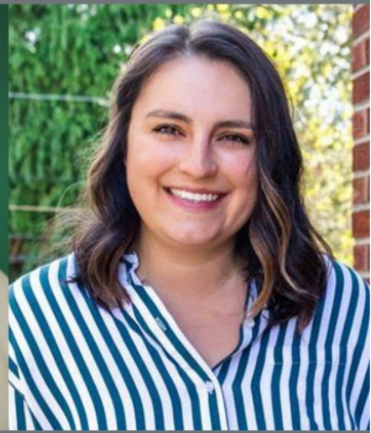
Lobbyist LEAGUE OF OREGON CITIES