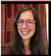
Didgette McCracken Open Campus & Ag. Facility, OSU Extension