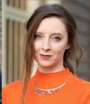
Regional Development Officer, Business Oregon