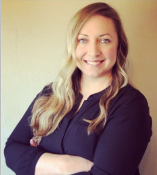
Economic Development Director, Grant County