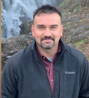
City Manager, City of Falls City