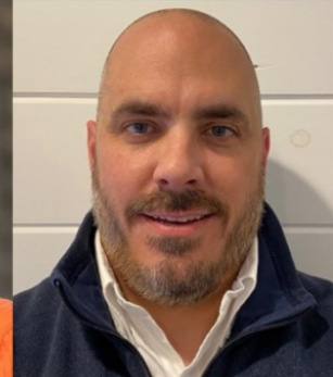
Project Manager, City of Salem

OEDA's Professional Development Committee is calling on YOU, our dedicated OEDA Members and Partners, to help develop and grow the OCED Training Program for future generations.