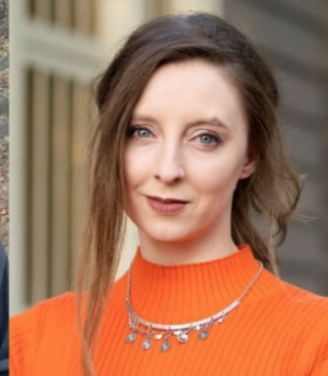
Regional Development Officer, Business Oregon