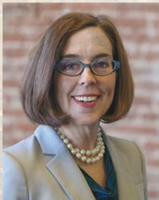
Governor Kate Brown